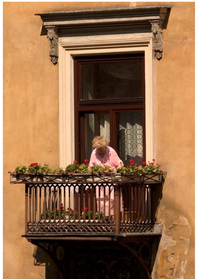
Tending Flowers - Kathie Carpenter