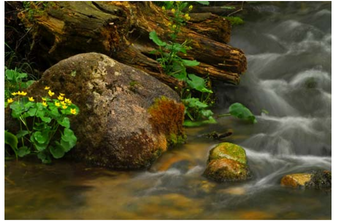
Seven Bridges – Bruce Bodjack

To register or for more information call NMC-EES at 995-1700 or visit our web www.nmc.edu/ees